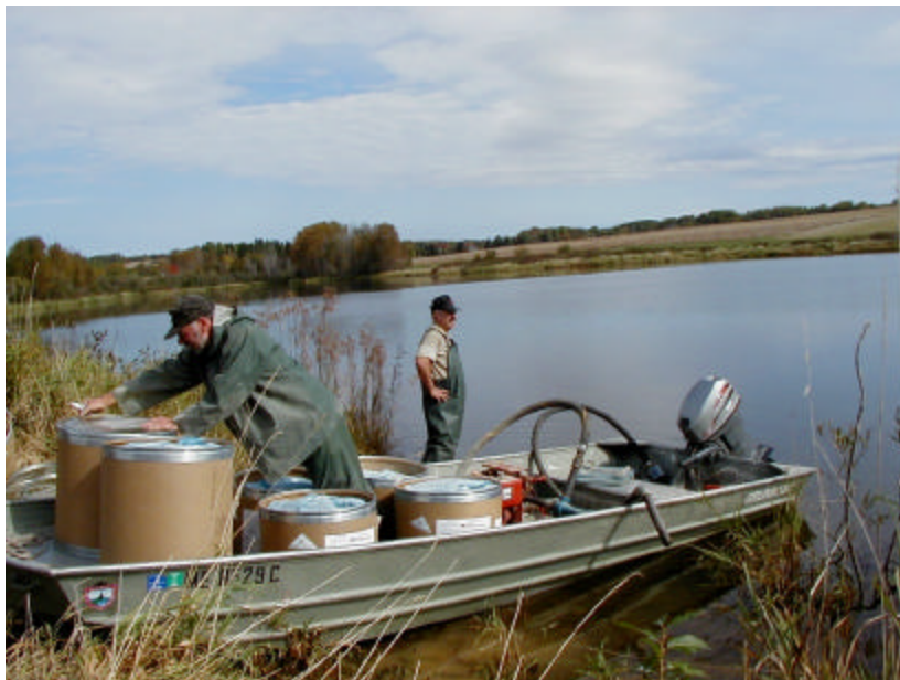
DIFW Biologists prepare to apply rotenone to eradicate illegally introduced smallmouth bass from Durepo Lake near Limestone.

Smallmouth bass were introduced into Umbagog Lake in 1985 and have spread throughout its tributaries, including the Rapid River where they may eventually out-compete and eliminate the renowned brook trout fishery. Because this invader has become so well established and cannot be eradicated in the Umbagog Lake system, Inland Fisheries and Wildlife regulations now encourage people to take as many as possible from the lake, as well as in